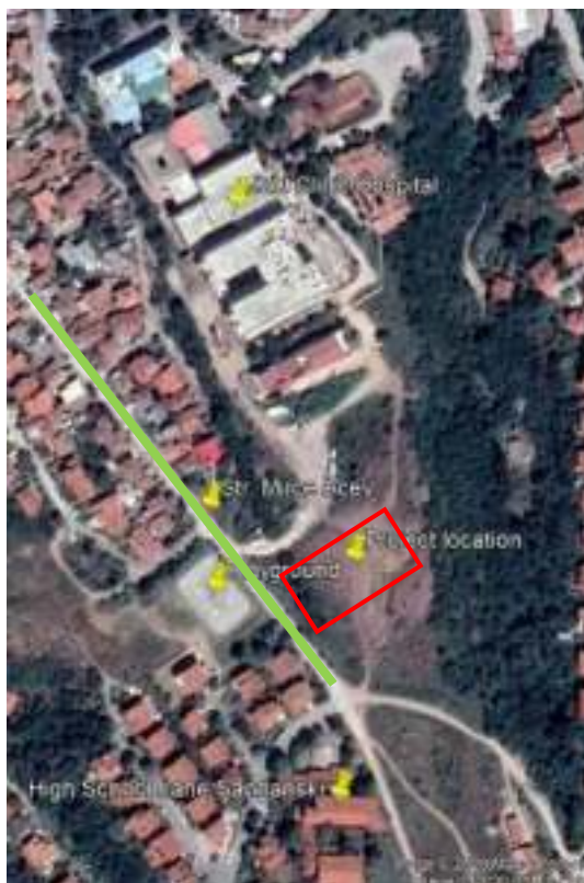
Figure 1 Micro location of the project area in Municipality of Stip