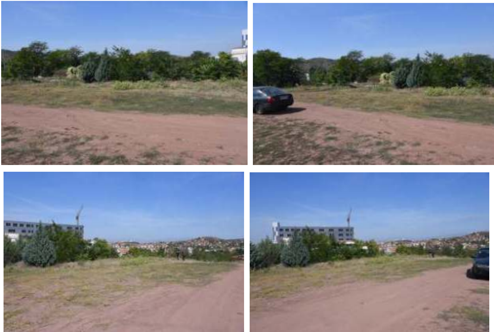
Figure 2 Pictures of the location where the mobile COVID 19 hospital will be installed